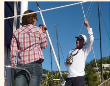
Kat's skipper - lapping it up as he is interviewed by the lovely reporter from Whitsunday TV...